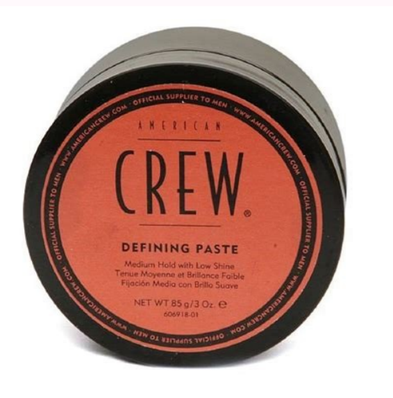
How to apply american crew forming cream.